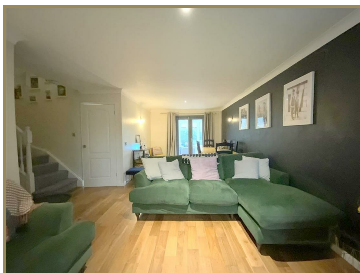
11 Harvest Crescent, Waltham, North East Lincolnshire, DN37 0XU £200,000